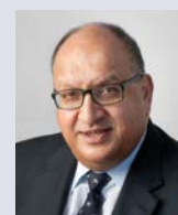
Anand Satyanand Human rights for people with mental illness Former Governor General of New Zealand, Wellington, New Zealand